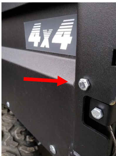
Figure 6: Top bolt holding the tailgate limiting cable.