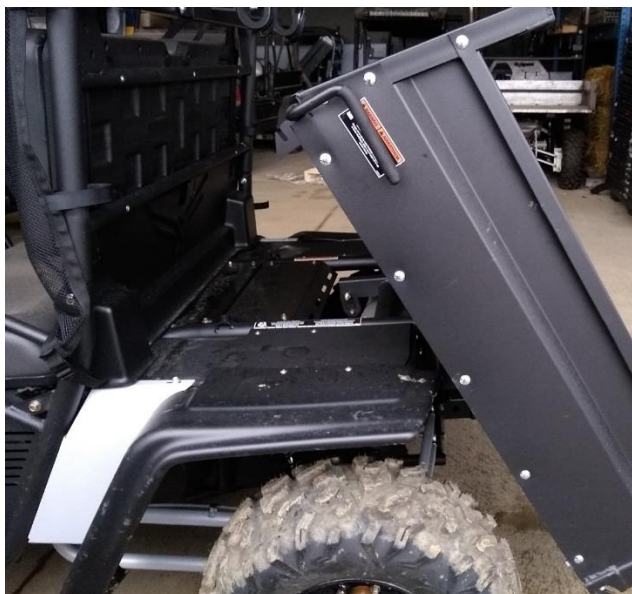
Figure 9: Bed in fully tilted position. Exercise caution when the bed is tilted.