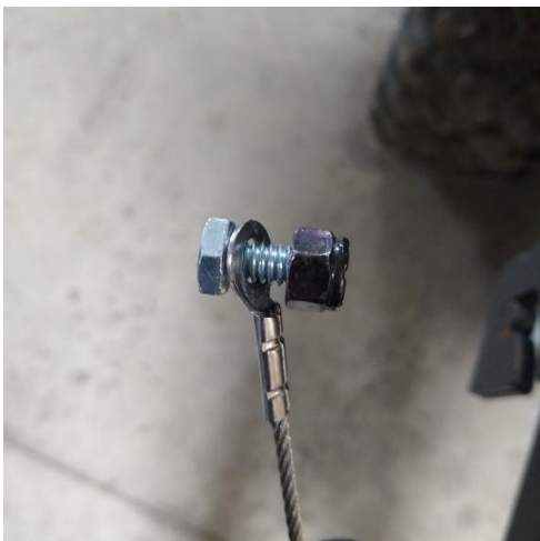
Figure 7: Bolt and nut put back on the cable.