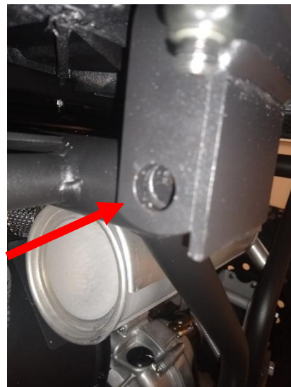
Figure 2: Bed hinge bracket lined up with the bed stub tube.