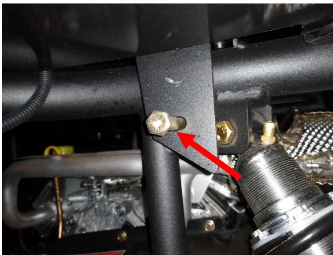
Figure 5: Bed latch fully engaged on the retaining bolt.