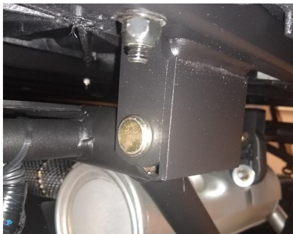
Figure 3: Bed hinge pin fully inserted through the bed hinge bracket and bed stub tube.