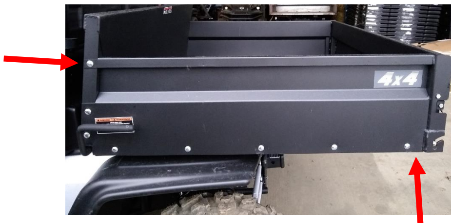
Figure 10: Bolts removed last.