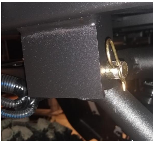
Figure 4: Hair pin inserted into the bed hinge pin.