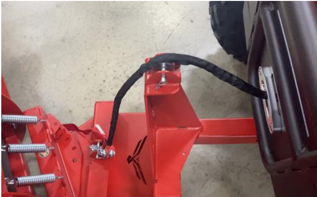
Figure 3: Winch cable routing and clip location.