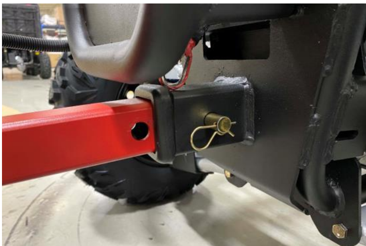
Figure 1: Snow plow mount tube secured to the vehicle front receiver using the clevis pin and hair pin.