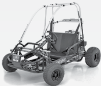
Model 3171 Ages 13 and up 25 mph max speed