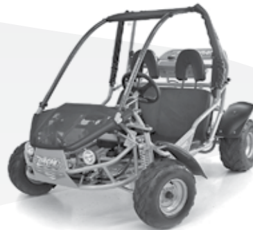
Model 6152 Ages 13 and up 39 mph max speed