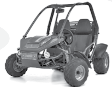
Model 7151 Ages 13 and up 39 mph max speed