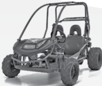
Model 5210 Ages 13 and up 25 mph max speed